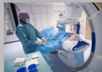
20" Flat Detector

Azurion is the new-generation Image Guided Therapy platform that provides a foundation for today and the innovations of tomorrow. It is backed by innovative services and support that offer a lifetime of benefits, reinforcing our commitment to you and your patients.