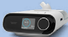
DreamStation BiPAP ST