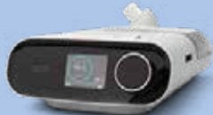
DreamStation BiPAP autoSV