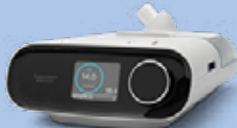
DreamStation BiPAP AVAPS