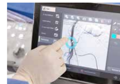
Touchscreen module Pro

The standard Windows 10 platform can help support compliance with the latest security and standards to protect patient data. It can also accommodate new software options to extend your system's clinical relevance over time.