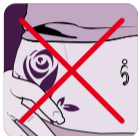
On tattoos or piercings