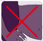
On dark skin