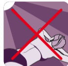
After recent sunbath