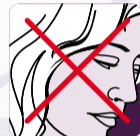
On light body hair colours