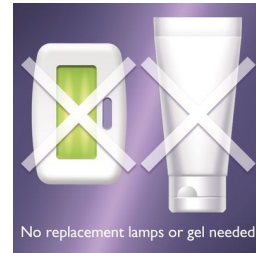
No replacement lamps or gel needed

Philips Lumea is a complete solution that comes ready to work right out of the box. More importantly, it does not require any replacement lamps or gels.