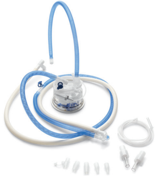
RT265 Fisher & Paykel infant dual limb (1141548)