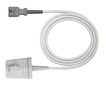
Re-usable adult soft SpO<sub>2</sub> sensor (Masimo) (1081516)