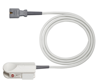
Re-usable adult finger clip SpO<sub>2</sub> sensor (Masimo) (1081984)