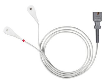
Re-usable multisite SpO<sub>2</sub> sensor (Masimo) (1081985)