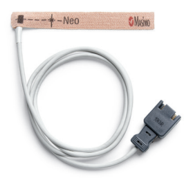
Pulse oximeter sensor, neonatal (1065306)