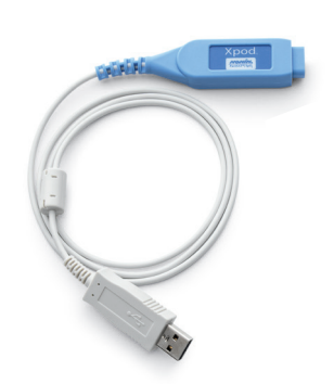
External pulse oximeter (Nonin XPOD - USB cable) (1129640)