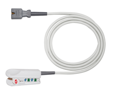
Re-usable ped finger clip SpO<sub>2</sub> sensor (Masimo) (1072878)