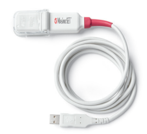
External pulse oximeter (Masimo USB cable) (1145408)