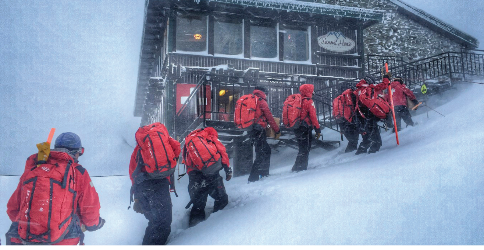
Crystal Mountain ski patrol.