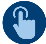
Outstanding user experience

Experience exceptional clarity and flexibility for performing a wide variety of cases with our fourth generation Flat Detector systems. Available with our standard 30 x 30 cm Flat Detector, 26 x 26 cm Flat Detector or the compact 21 x 21 cm Flat Detector.