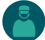
Enhance your clinical capabilities over time