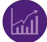
Increase OR performance