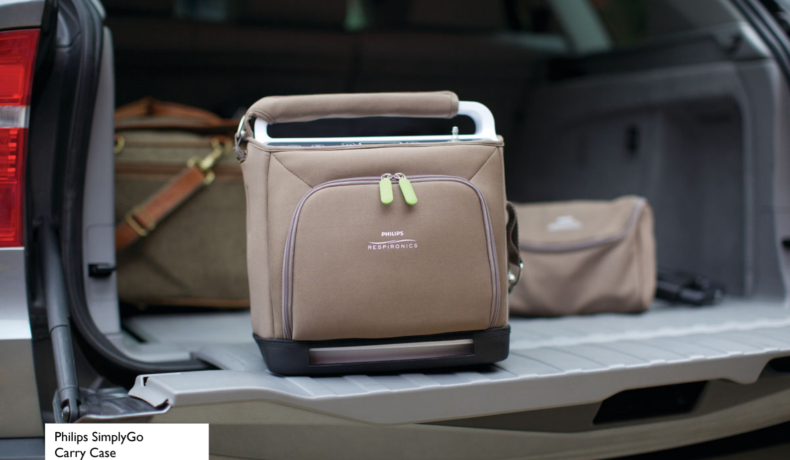
Philips SimplyGo Carry Case