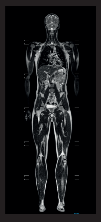
T2w TSE Resolution: 1.2 x 1.5 x 6.0 mm Scan time: 0:24 min /station Achieva dStream 1.5T