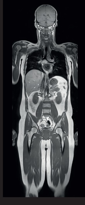
T1w TSE Resolution: 1.6 x 2.1 x 6.0 mm Scan time: 1:32 min /station Ingenia 1.5T