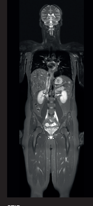
STIR Resolution: 1.6 x 2.6 x 6.0 mm Scan time: 1:20 min /station Ingenia 1.5T

© 2018 Koninklijke Philips N.V. All rights reserved. Specifications are subject to change without notice. Trademarks are the property of Koninklijke Philips N.V. or their respective owners.