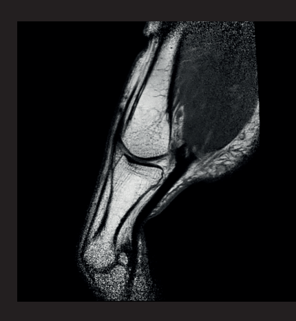
Sagittal PDw aTSE – Finger Resolution: 0.2 x 0.2 x 1.5 mm Scan time: 3:16 min Ingenia 1.5T