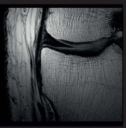
Coronal PDw TSE – Knee Resolution: 0.4 x 0.4 x 1.5 mm Scan time: 4:15 min Ingenia 3.0T

Sagittal PDw TSE – Foot Resolution: 0.4 x 0.4 x 1.5 mm Scan time: 4:03 min Ingenia 3.0T