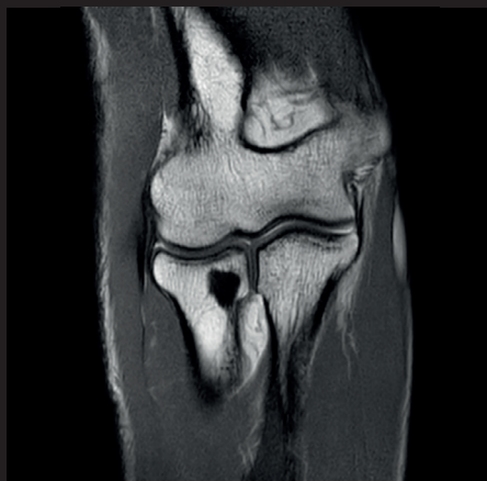
Coronal PDw TSE - Elbow Resolution: 0.4 x 0.5 x 3.0 mm Scan time: 3:58 min Ingenia 1.5T