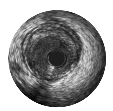
Hi-Q level 1