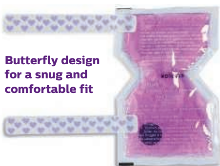
Butterfly design for a snug and comfortable fit

The Heel Snuggler is our only infant heel warmer designed to truly conform to infants' heels while also staying firmly in place without skin adhesives. The unique, butterfly-shaped design uses two soft, perforated straps for a comfortable and secure fit and easy removal. The design provides consistent warming of the entire sole and heel of the foot prior to a heel stick procedure.