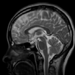
Anatomy: Brain Sequence: T2