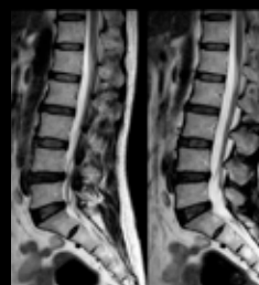
Anatomy: Spine Sequence: T2 Scan Time: 3.19m Thickness: 4mm