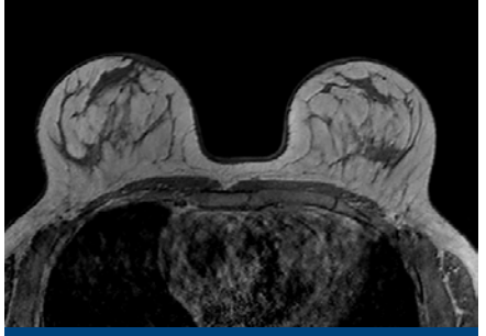
Axial T1w FFE 3D Resolution: 1.0 x 1.0 x 1.0 mm Scan time: 0:57 min Ingenia 1.5T