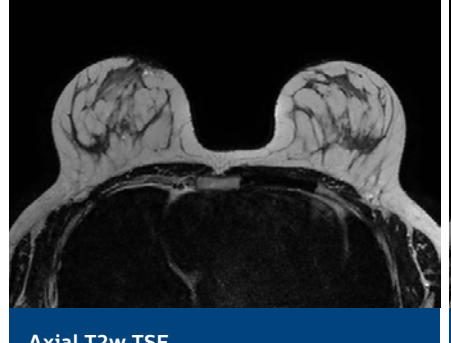
Axial T2w TSE Resolution: 1.0 x 1.1 x 3.0 mm Scan time: 3:16 min Ingenia 1.5T