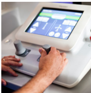
Ease of use – simple, intuitive user interface