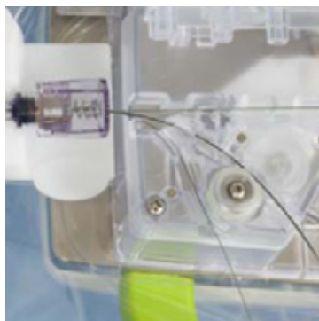
Open architecture – flexibility to use your preferred stent and guidewire