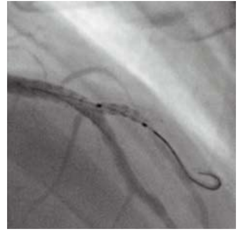
Left coronary artery bifurcation stent contrast