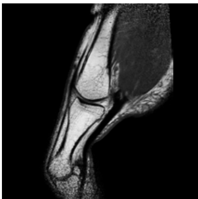
Sagittal PDw aTSE – Finger Resolution: 0.2 x 0.2 x 1.5 mm Scan time: 3:16 min Ingenia 1.5T