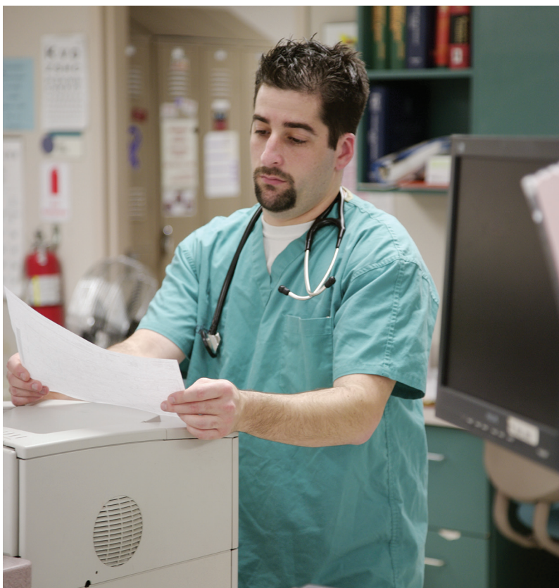
Transmitting a patient's ECG on the way to the ED can speed treatment.