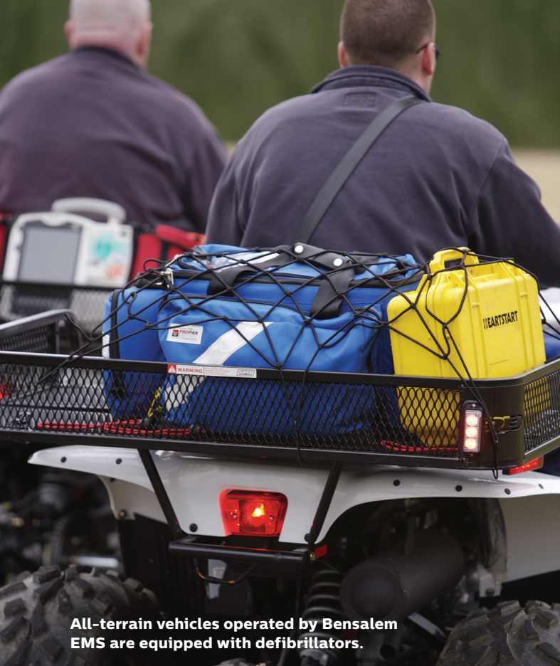
All-terrain vehicles operated by Bensalem EMS are equipped with defibrillators.