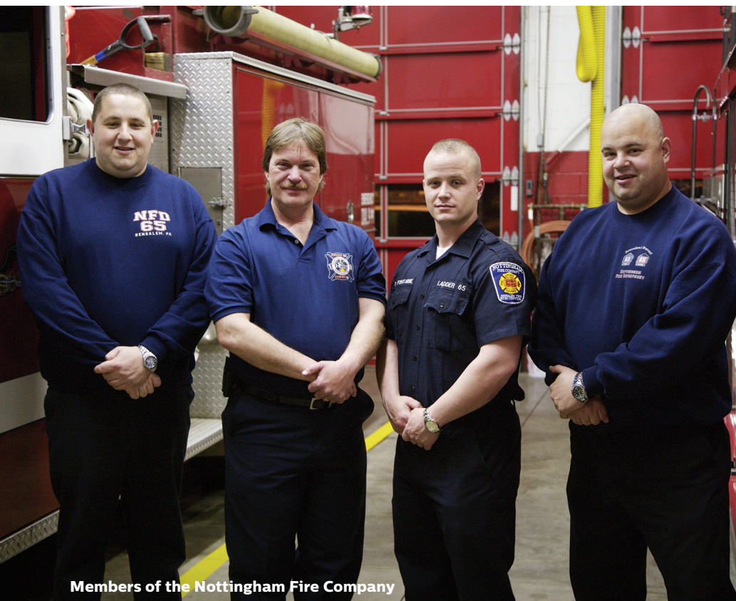
Members of the Nottingham Fire Company