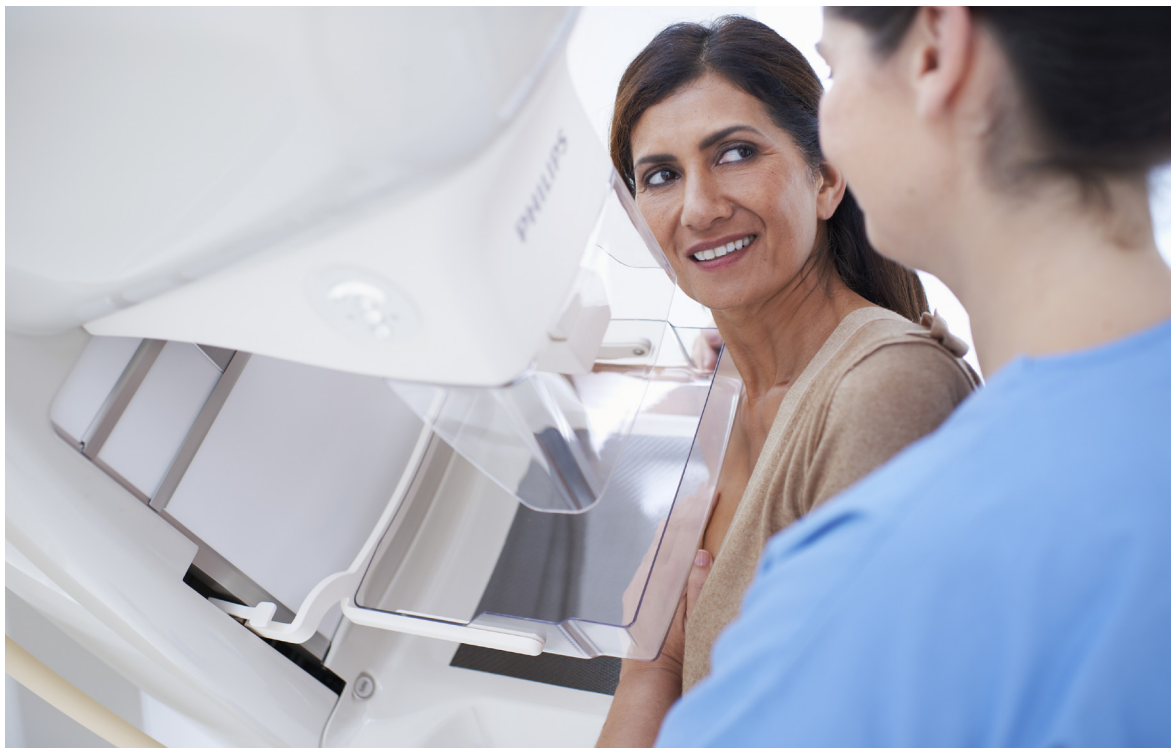
Figure 3: MicroDose Mammography unique FOV size is designed to meet breast screening needs.

Accordingly, we conclude that the 24 cm X 26 cm FOV can be used for screening, as well as the 24 cm X 30 cm FOV, with little or no difference in the number of women requiring extra views. The unique MicroDose FOV size can accommodate and position both larger and smaller breasts.