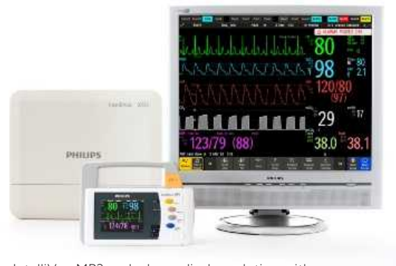
IntelliVue MP2 and a large display solution with IntelliVue XDS software.