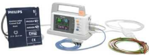
Philips offers a wide range of supplies, including cuffs, SpO 2 sensors, and a variety of cables and leads to optimize performance of your Philips equipment.