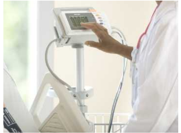
Features an intuitive touchscreen with configurable SmartKeys.