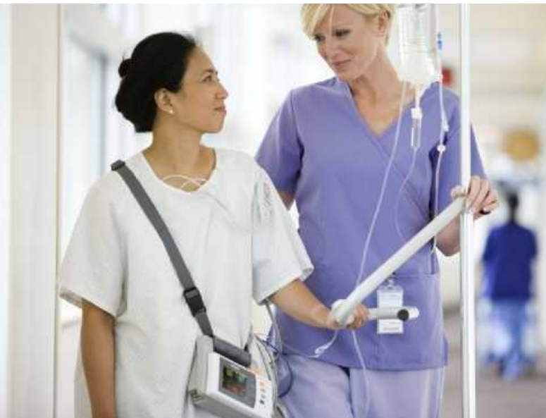
IntelliVue MP2 is so compact, it's easily carried by patients in low-acuity settings.

Connect to a large display solution with Philips IntelliVue XDS software to transform the compact IntelliVue MP2 into a versatile standalone monitor, with the same outstanding screen flexibility available in high-acuity IntelliVue monitors. XDS remote-control functionality gives you the flexibility to access and control the IntelliVue MP2 wherever and however you choose to optimize your workspace ergonomics. To support clinical workflow optimization a large display solution with Philips IntelliVue XDS software also allows local printing from the IntelliVue MP2 monitor.