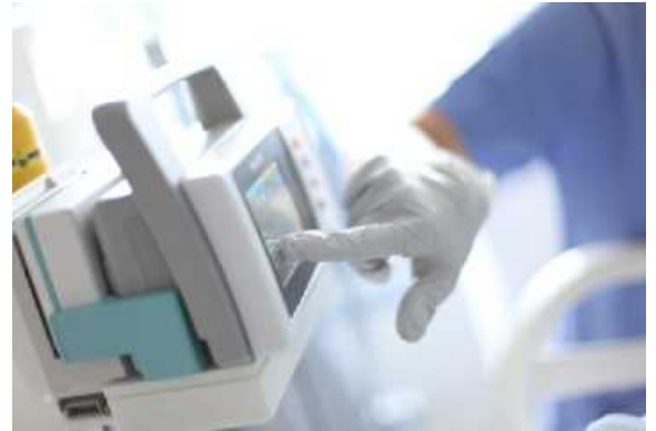
The Philips X2/MP2 Battery Extension provides additional battery run time of up to six 2 hours for intra-hospital patient transport and concurrent CO 2 measurement with additional invasive blood pressure and temperature measurement.