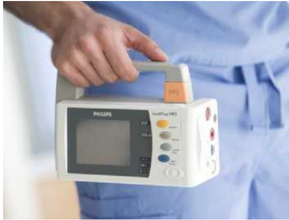
The basic monitor weighs just 1.5 kg (3.3 lbs).