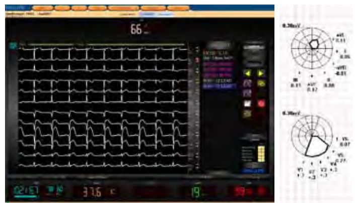
ST Maps facilitate quick and easy viewing of multi-lead ECGs

Early detection of ST-segment elevation myocardial infarction (STEMI) shortens “discovery to treatment” times. The DXL Algorithm enables Philips patented ST Maps, a graphical indication of ST elevation or depression. Philips ST Maps meet the 2009 AHA/ACCF/HRS’s recommendation that the spatial orientation of ST-segment deviations be displayed in both frontal and transverse planes. The maps provide distinct patterns for different anatomic sites of acute infarcts, region of ischemia, and other conditions, helping physicians assess a patient’s condition before and during the procedure. After the intervention, ST Maps provide visual verification of the results, allowing assessment of the extent of the infarct and the success of the stent in alleviating the condition.