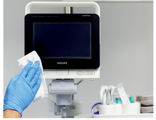
*Standard in the U.S.