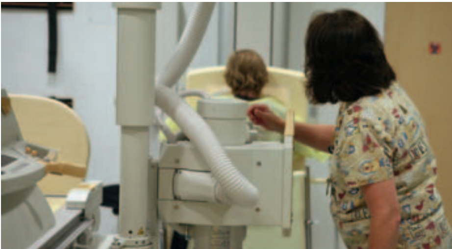
The digital vertical stand increases the range of applications