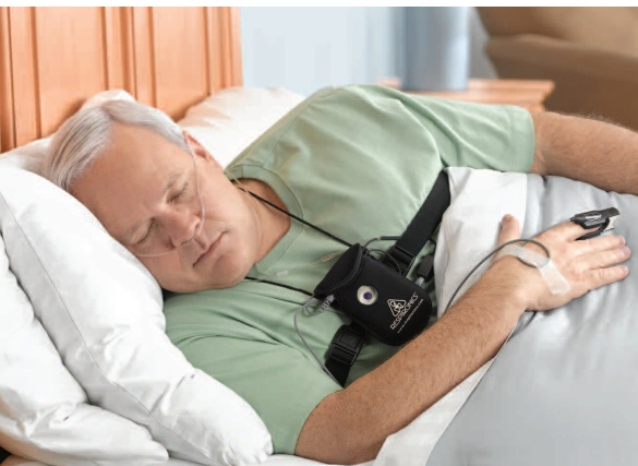
Lightweight and compact for comfortable sleeping.